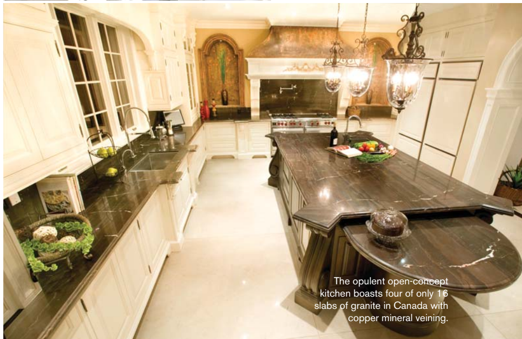
The opulent open-concept kitchen boasts four of only 16 slabs of granite in Canada with copper mineral veining.