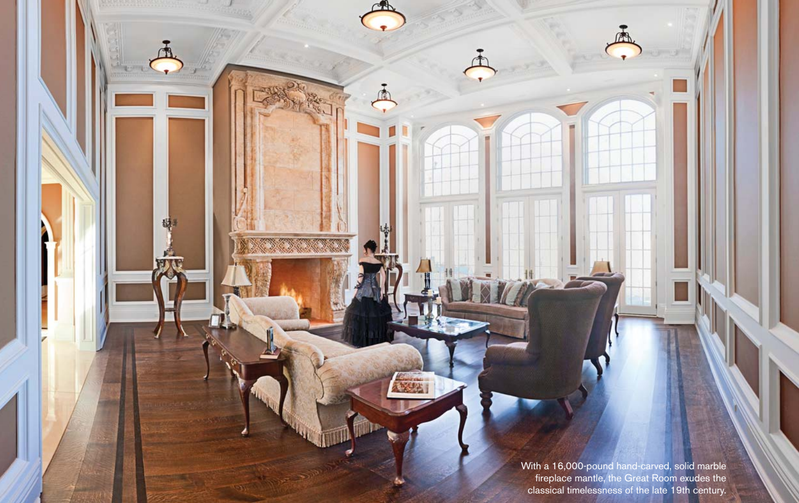
With a 16,000-pound hand-carved, solid marble fireplace mantle, the Great Room exudes the classical timelessness of the late 19th century.